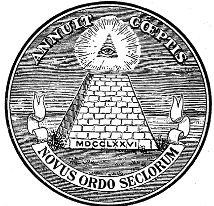
Great Seal of the United States—Obverse and Reverse.

EVERY PASSING year brings new evidence that we are approaching the Aquarian Age and that we are even now within the orb of its influence. The Aquarian Age is to make many old things new. The person who is strongly influenced by the sign Aquarius is usually a pioneer, and Uranus, the ruler of Aquarius, builds anew after having destroyed the old.