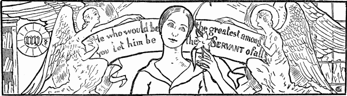
A Character Delineation of the Children Born between August 24th and September 23rd, inclusive, 1931.

Virgo, the sign of the celestial Virgin, is one of the great feminine Mystery signs of the zodiac. The sheaf of wheat which she carries typifies the "living bread" of service (for like Christ we too must give of our bodies, flesh and blood, as a LIVING sacrifice) which nurtures the soul. And this is why we find that this sign produces in its higher aspects some of our most saintly characters, whose ethereal spirituality seems angelic rather than human. But among those who respond to the lower phases of Virgo, the "younger souls" born under this sign, we find a type which is perhaps the most difficult of all to cooperate with because of its carping criticalness, which sees so many sun spots that it forgets all about the sun.