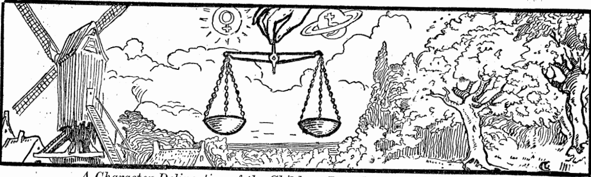
A Character Delineation of the Children Born between September 20th and October 23rd, Inclusive, 1930.

The children of Libra are usually well shaped and have healthy bodies, a good complexion, and a beautiful face. They are suave, overcautious, kind, very sympathetic, fond of the opposite sex, and are very often ruled and influenced by those whom they admire. The Libran's weakest point is his extreme self-esteem, and on account of this he is often blind to his own weaknesses. Having very high ideals he is sometimes a little fearful, weighing everything very carefully. He has a love of harmony and neatness and is usually honest in his dealings with others.