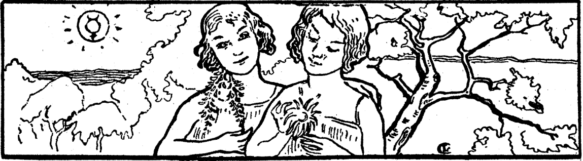
A Character Delineation of the Children Born between May 22nd and June 21st, inclusive, 1930.

The Gemini children are usually very restless but alert. They find it very hard to sit still, and must have change to keep them contented. Gemini having rule over the hands and arms of the Grand Man of the Heavens, these children as a rule are very clever with their hands and nimble-fingered. Therefore we find the Gemini people employed as clerical workers, such as stenographers, telegraph operators, bookkeepers. They are inclined to follow vocations which require a quick mentality for Mercury, the ruler of the mind, is the natural ruler of Gemini, and these people are therefore of the mental type. While they are very quick to learn, they are also very quick to forget, for they are changeable and very prone to skim over the top in the matter of learning, and for that reason they forget easily. They are usually very good-natured and easy to get along with.