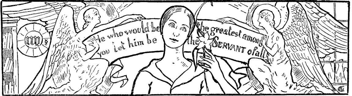
A Character Delineation of the Children Born between August 24th and September 23rd, inclusive, 1927.

Virgo is the night sign of Mercury, the planet of reason, which has rule over the mentality of man, and Virgo people therefore are as a rule of a scientific and intellectual nature. They take readily to the study of history and science. They take especially keenly to the study of dietetics, as the sign Virgo rules the house of health and sickness. Therefore all studies pertaining to the science of healing and nursing are attractive to the Virgoan. His memory is usually good and the mind deep and ingenious, persevering and systematic. But one great weakness of the Virgo person is that he is very prone to criticize. In his eyes no one can do things as well as he himself.