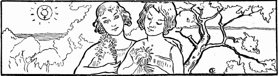
A Character Delineation of the Children Born between May 22nd and June 21st, inclusive, 1927.

The children of Gemini as a rule are restless, changeable, and lacking in energy and initiative. They are dual in nature, which causes them to change their minds frequently. Their promises are made with the best intentions, but too frequently they are not kept because some one has influenced them to do something else, and forthwith their promise is forgotten. The Gemini person loves change. His desire to please is the great reason for his wavering and being unsettled. Too frequently he is torn between two desires, like the boy on the fence who doesn't know which way he should jump. The Gemini man is nimble with the fingers and quick as a mental worker, but he is prone to have too many irons in the fire, which frequently spells failure.