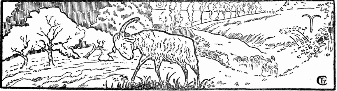
A Character Delineation of the Children born between March 21st and April 20th, inclusive, 1926.

The children born during the time that the sun is passing through the cardinal and martial sign of Aries may be likened in disposition to the equinoctial period, for at this time of the year the sun, which is in its exaltation sign, crosses the equator, and the weather may one day be smiling and sunshiny, when of a sudden up comes a gale, sometimes a thunderstorm, and then a rainbow in the sky. The equinoctial period is always accompanied by a lot of wind, and so we find the people with the sun in this cardinal sign. They are impulsive, rush into things, making a lot of noise and bluster; and when one does not understand them, they often hurt one's feelings, but they do not mean to do so. It is a way they have of rushing impulsively and hastily into everything, with a lot of talk, but they soon calm down and are most loving: A few kind words, a little approbation, and they are yours. They make most interesting companions, for they are mentally alert and keep abreast of the times. They are easily taken in by others, as they are not good judges of human nature. The reason is that they rush into things without stopping to think, acting much under impulse.