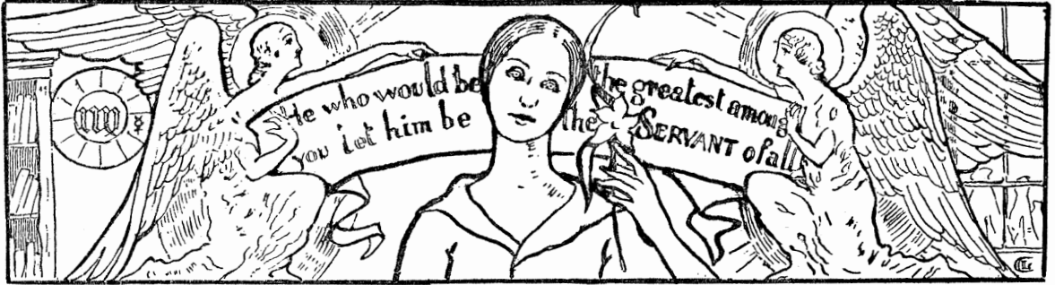
A Character Delineation of the Children Born between August 23rd and September 22nd, inclusive, 1924

Generally speaking the children of Virgo are very shy and retiring, but they are quick and nimble. The children born this year as the sun passes through this scientific sign will come more to the fore than is usual with the Virgos, for we have the aggressive Mars in the advanced sign of brotherhood and fellowship, Aquarius, supported by the rays of the powerful Saturn through a trine from his sign of exaltation, Libra.