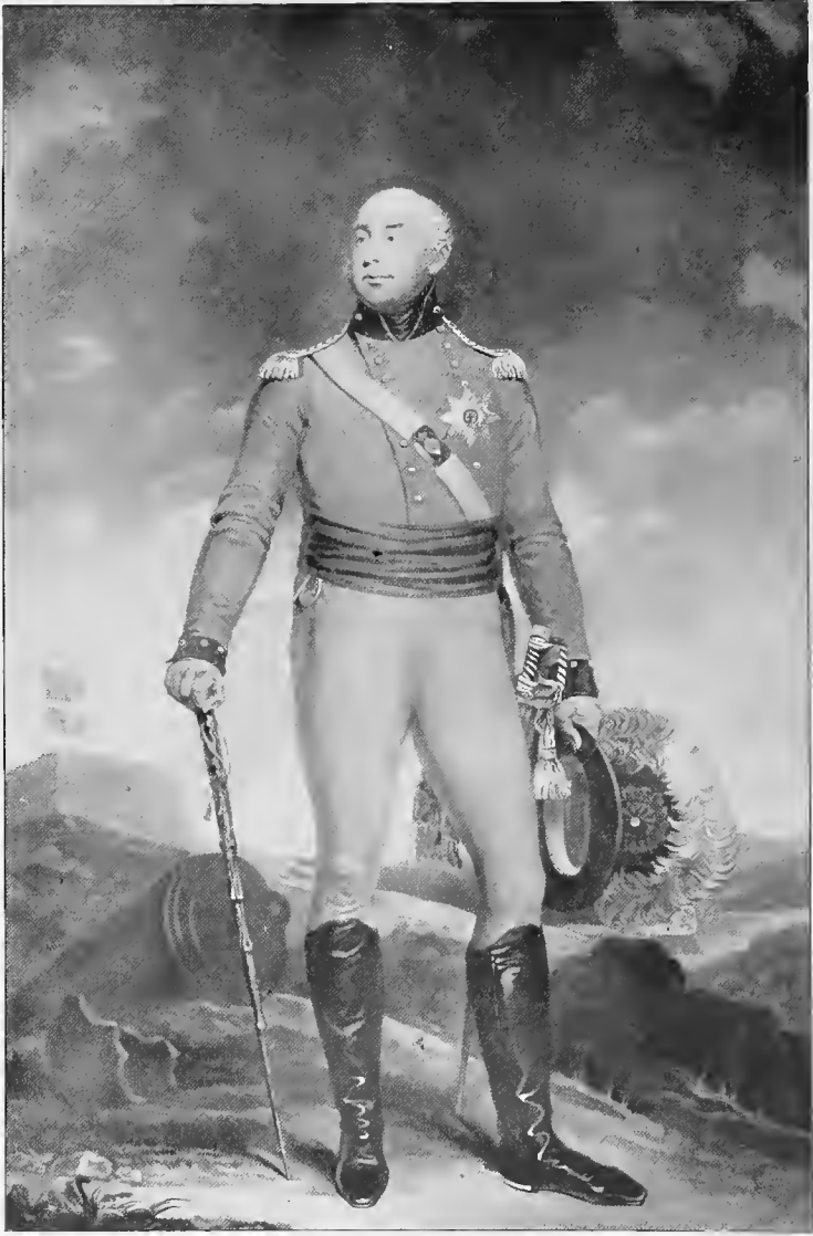
HIS ROYAL HIGHNESS PRINCE EDWARD DUKE OF KENT,

PROVINCIAL GRAND MASTER OF "ANCIENT" FREEMASONS OF LOWER CANADA, A.D. 1792-1812.