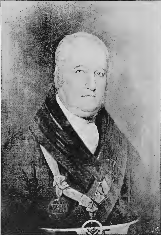
THE HONORABLE CLAUDE DÉNÉCHAU, M.P.,

PROVINCIAL GRAND MASTER OF UNITED "ANCIENT" FREEMASONS OF LOWER CANADA, A.D. 1813-22; AND DISTRICT G.M. OF QUEBEC AND THREE RIVERS, 1823-36.