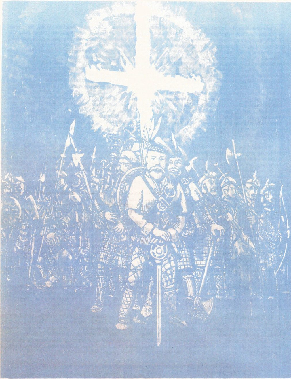
THE BATTLE OF BUNOVAR