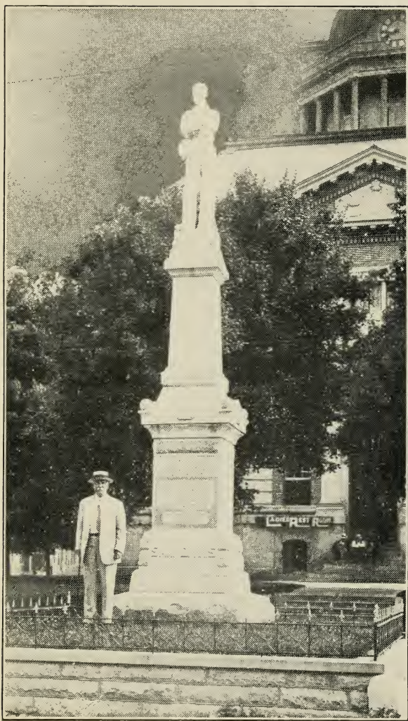
SAM DAVIS MONUMENT