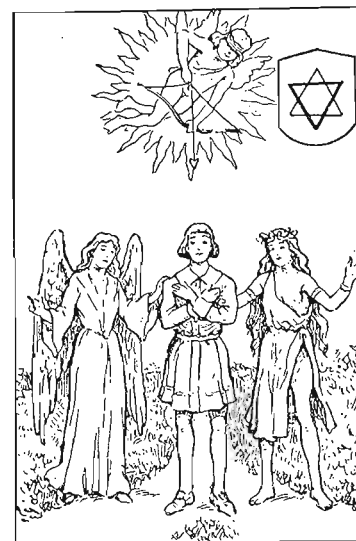
6 L'AMOURAUX 7

This special deck of Tarot cards, beautifully and artistically done in full colors by J. Augustus Knapp (who so ably illustrated Mr. Hall's monumental work on Symbolical Philosophy), contains not only the distinctive features of all preceding decks but additional material secured by Mr. Hall from an exhaustive research into the origin and purpose of the Tarot cards. For convenience the Tarot cards have been printed in the size and style of standard playing cards. A 48-page explanatory brochure by Mr. Hall accompanies each deck. Postpaid $3.00.