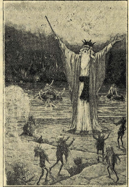
Conjuring the Children of the Elements —Gnomes, Undines, Sa'amanders, Sylphs.

One of the full page color prints in the Encyclopedic Outline of Masonic, Hermetic, and Rosicrucian Symbolical Philosophy; to which is added a Treatise on the Qabbalah of the Jews. Being an Interpretation of the Secret Teachings Concealed within the Rituals, Allegories, and Mysteries of All Ages. The Entire Work Amplified with Numerous Quotations from Ancient, Medieval, and Modern Authorities, many from Unpublished Manuscripts and Books Long out of Print, Gathered by the Author,—Manly P. Hall.