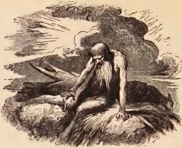
THE DESOLATION OF JOB