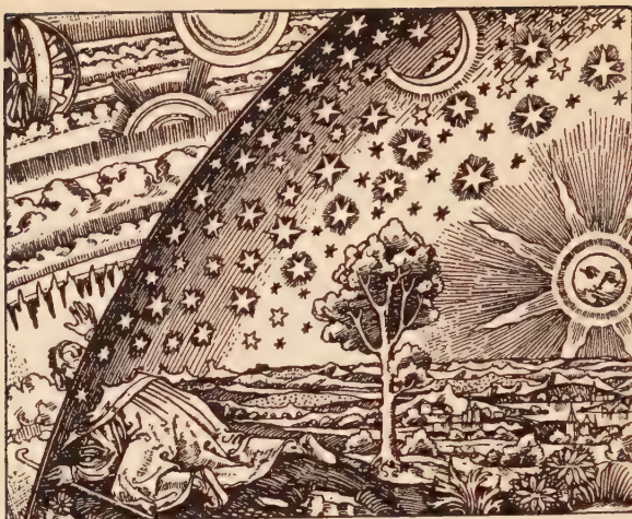
THE SEER BEHOLDING THE HEAVENLY WORLDS