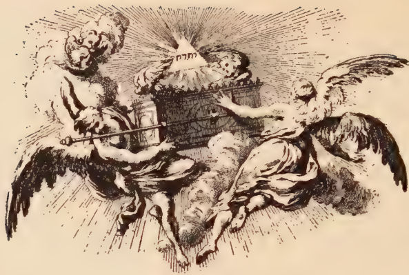
THE ARK OF THE COVENANT SUPPORTED BY CHERUBS