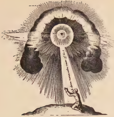
THE GLORY OF THE MOST HIGH