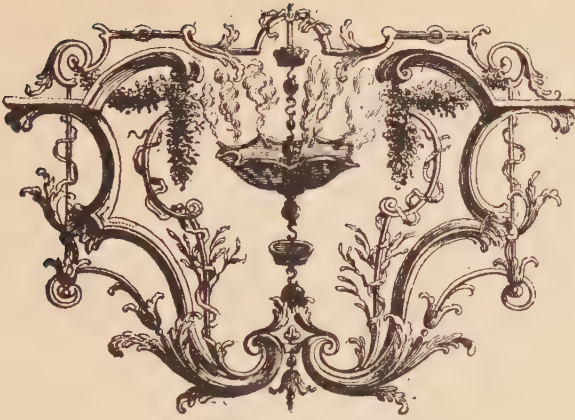
THE LAMP OF THE SABBATH