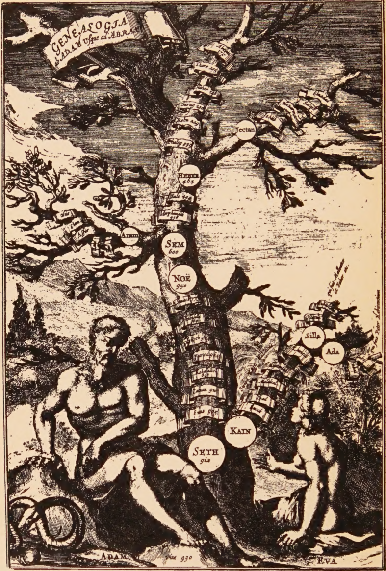
—FROM KIRCHER'S ARCA NOE