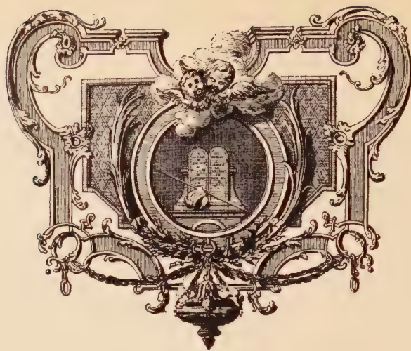
THE TABLES OF THE LAW