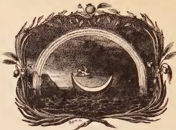
THE LUNAR ARK ON THE FACE OF THE WATERS