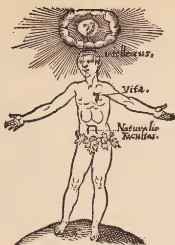
THE DIVINE NAME ON THE BODY OF ADAM