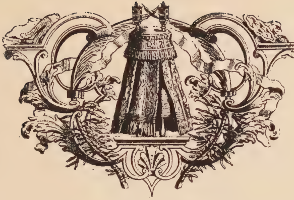
THE ROLL OF THE LAW WITH ITS ORNAMENTS