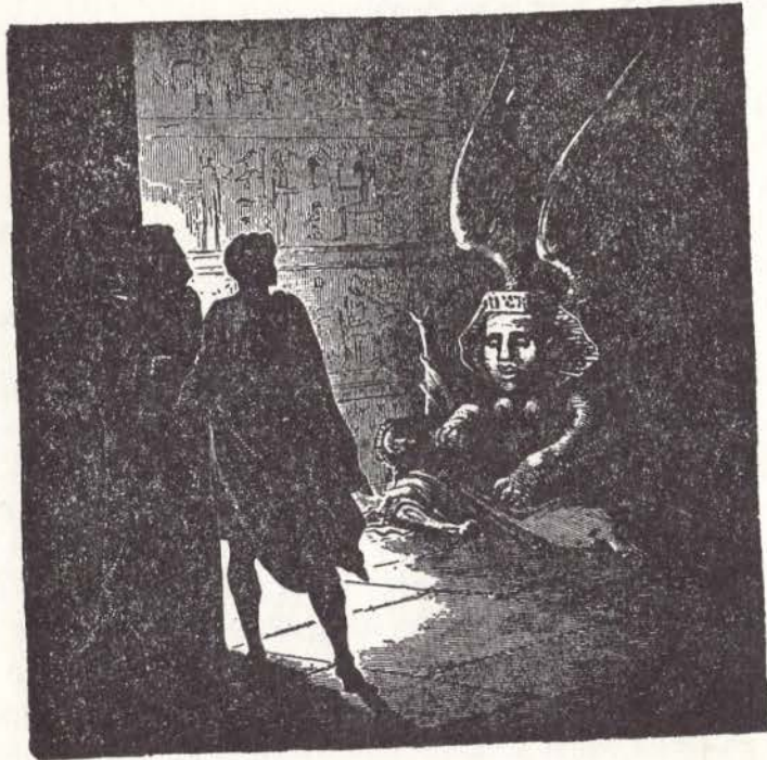
A SCENE FROM THE DRAMA OF INITIATION (FROM CHRISTIAN'S HISTOIRE DE LA MAGIE)