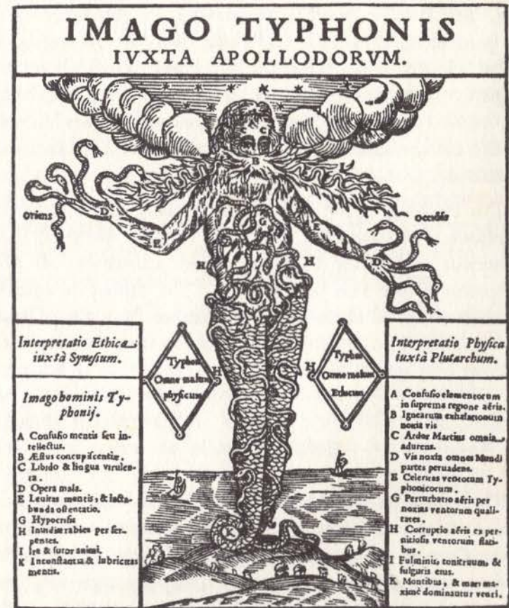
SYMBOLIC DEPICTION OF TYPHON (FROM KIRCHER'S ŒDIPUS ÆGYPTIACUS )

die out can the disciple approach the Nirvanic state. Typhon is the inferior or lower self, the Human Will of Boehme. It