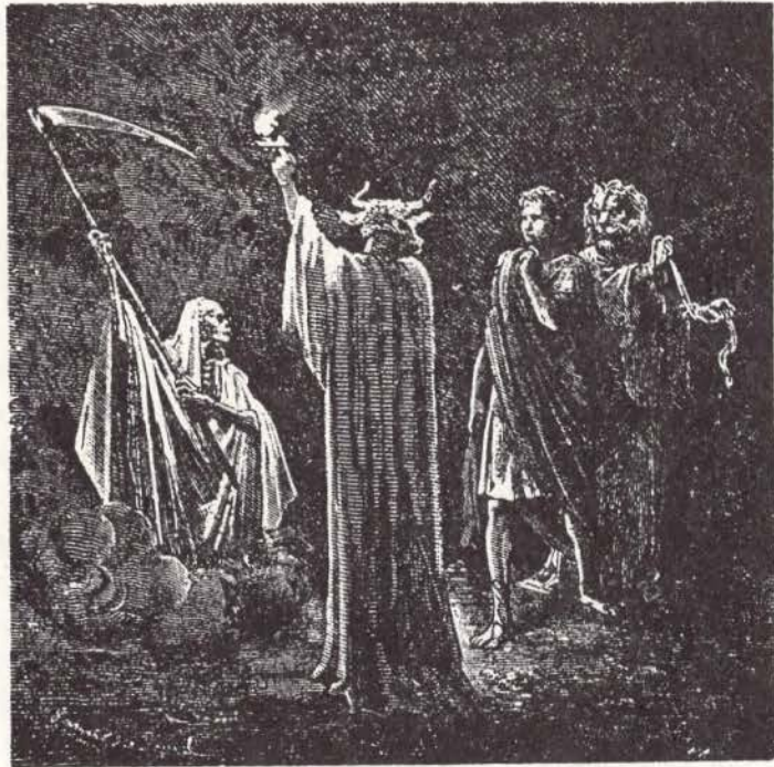
SPECTRAL FORMS APPROACH THE NEOPHYTE