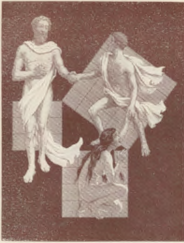
47TH PROPOSITION OF EUCLID