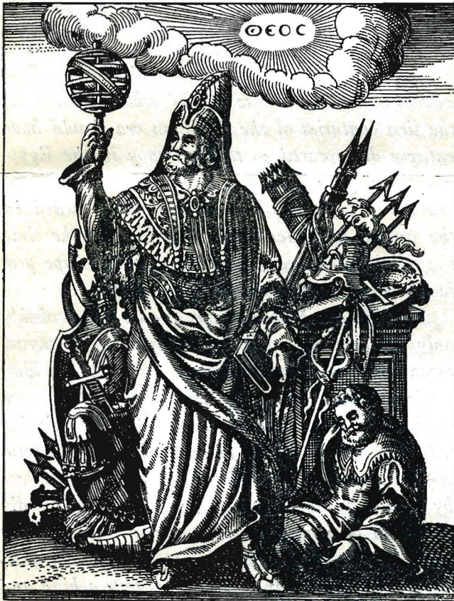
The Initiate Priest of the Egyptians, HERMES TRISMEGISTUS

There is not the slightest surviving hint as to the parentage of Hermes or the circumstances sur-