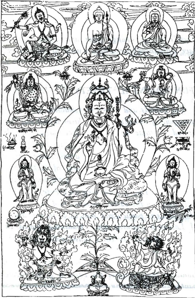
THE FOUNDER OF LAMAISM, ST. PADMA-SAMBHAVA.

descended from the heavens and rested in his hand, a great light filled the whole world, and the blindness of his eyes was cured. After the vision had passed, the king realized that a miracle had indeed been wrought, for his sight was restored and word came to him that a rainbow of light had come down from the heavens and floated upon the lotus lake of Dhanakosha. This light extended not only