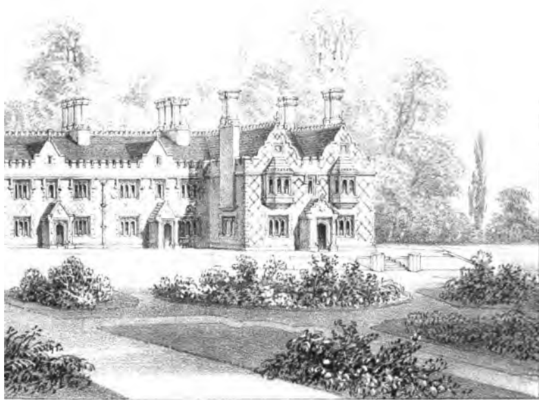
Das St. San Mihel to the Queen.