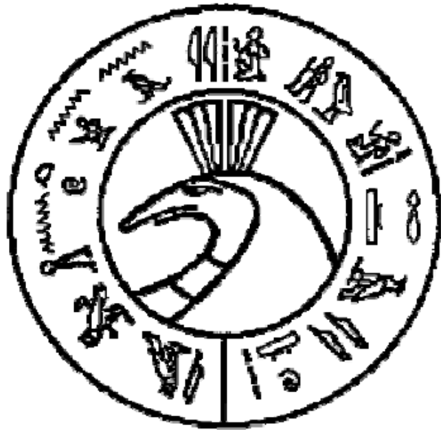
The Word of the Aeon of Set is

curiosities. But I wish to remember the Church of Satan and the Magus of that Age. Therefore let the years of my Aeon be counted from the conception of the Church of Satan. And now, having looked upon the past with affection and reverence, we shall turn our gaze to the times before us. Think carefully of the Word of Set, for it is given in witness to my Bond. Behold, O West, I have established my Aeon. I punish the enemies who are in it, placed in the Place of Destruction. I deliver them to the examiners from whose guard there is no escape. Lo, I pass near to thee, I pass near to thee. Affix now my image as it was given to you, so that all who read of these matters may now look upon the likeness of Set.