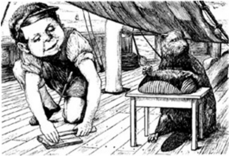
The Beaver kept looking the opposite way

The Beaver's best course was, no doubt, to procure A second-hand dagger-proof coat—— So the Baker advised it——and next, to insure Its life in some Office of note: