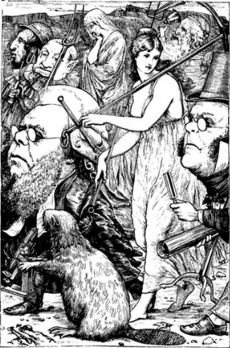
“To pursue it with forks and hope”