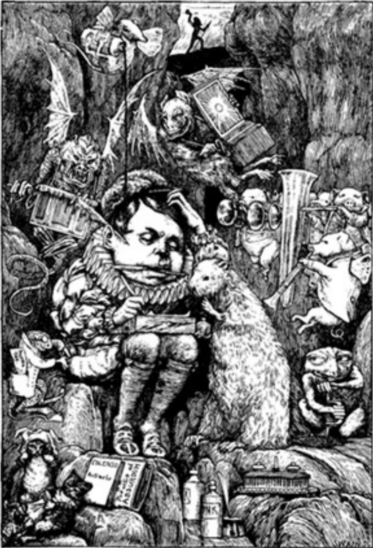
The Beaver brought paper, portfolio, pens