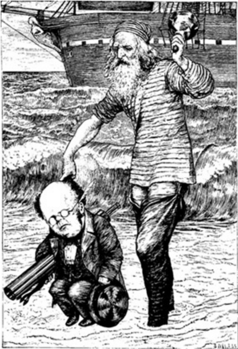
Supporting each man on the top of the tide