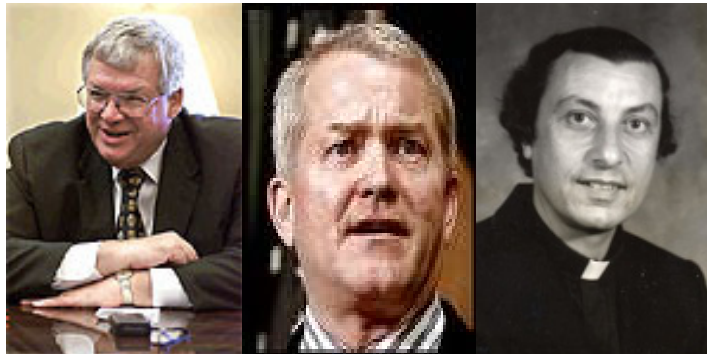
The Speaker, The Rep. & The Priest

since the armed robberies began in 1982, police last month released identikit photos of possible suspects.