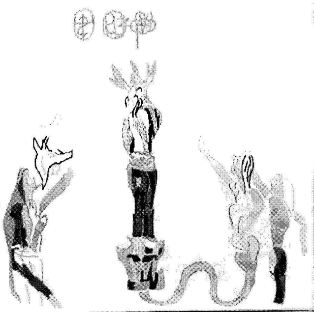
Sabbath of the Succubus

Below are two examples of spirits evoked utilizing automatic drawing technique. The second drawing will be discussed at length momentarily, but for the moment take note of how each of the drawings consist of outlined figures, not detailed images. Greater detail can be added after an artist has developed some skill with the automatic painting process.