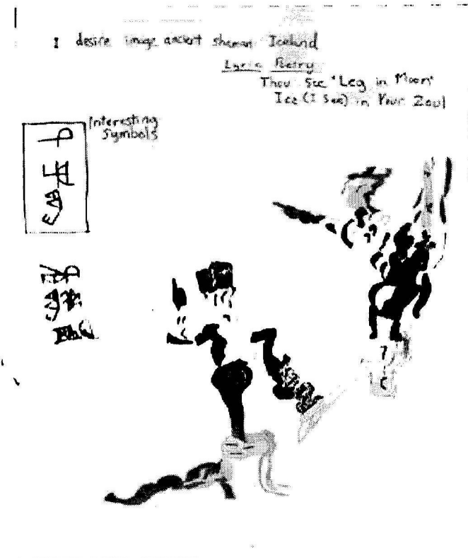
Leg in Moon the Ice Shaman

reader with a kind of awe, turn the picture upside down and examine it again. Suddenly, what appeared to be a Flame Angel now emerges as a Sorcerer flinging a fireball toward the observer, surrounded at each of the cardinal points by large flames. Above his head, the sorcerer appears to have opened a rift exposing a star populated portion of deep space!