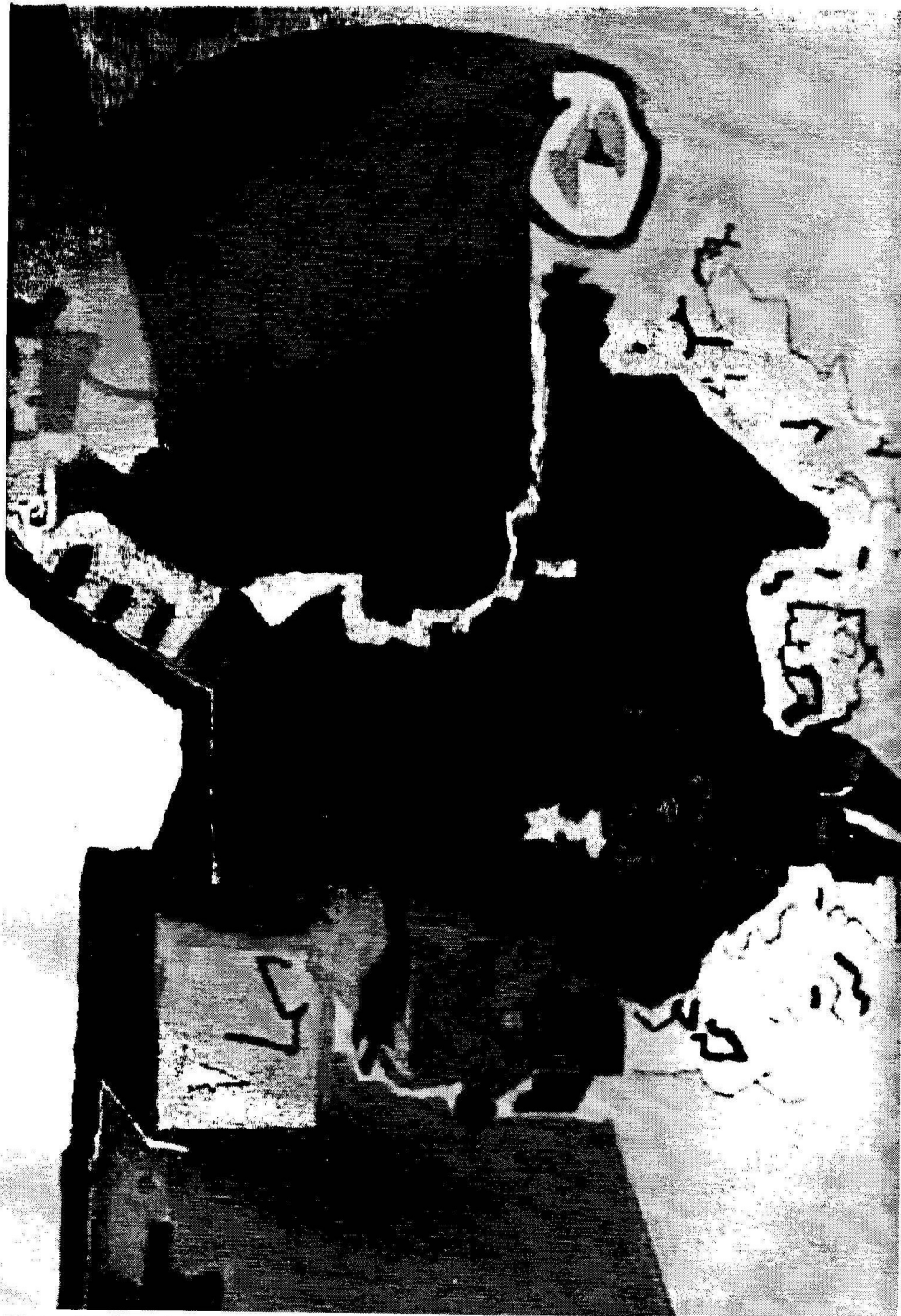
The Salvation of a Controlbot