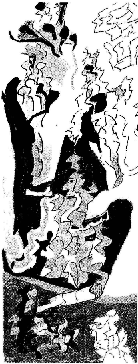
Peering Into the Past