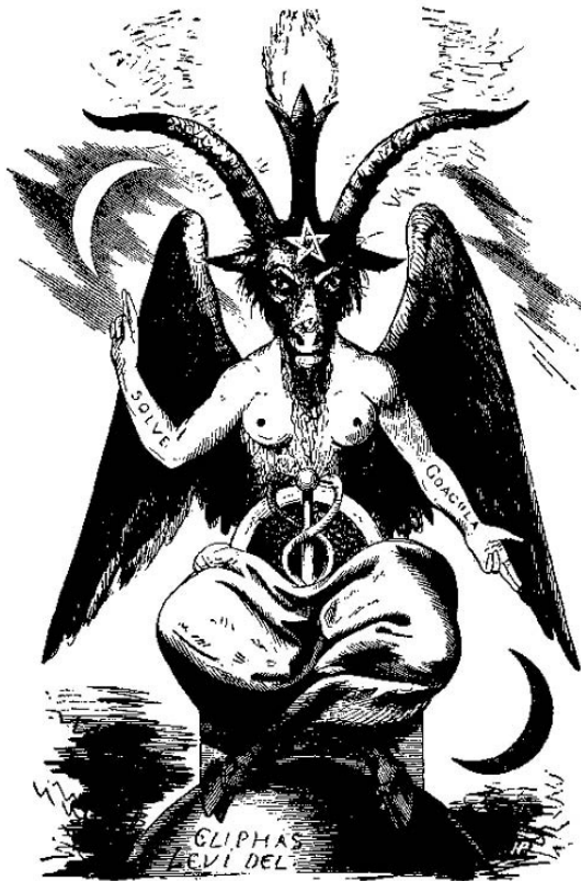
THE SABBATIC GOAT