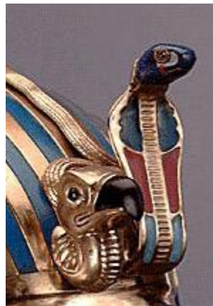
The Uraeus

- Ouroboros is a "tail eater" dragon who constantly holds its tail in its mouth. First discovered in Egypt as early as 1600 BC, Egyptians worshipped Ouroboros , as Sata, (Satan) or "Tuat", on whose back the sun god rose through the underworld each night. In Greece, it is the symbol of the universe and eternity. The serpent devouring its own tail to sustain its life is an eternal cycle of renewal, symbolising the cyclic Nature of the Universe - that creation comes forth of destruction, and life out of death. The serpent biting its tail is found in other mythological cultures as well, including Norse myth, where the serpent's name is Jormungand.