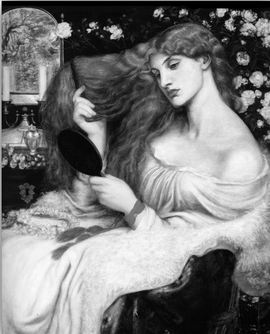
LADY LILITH BY DANTE GABRIEL ROSSETTI

“Vampyre” is also the older and more classic spelling popularly used in the 19 th century, originating from the Latin word vampyrus . The word “vampire” came into the more modern usage with the translation from Eastern European names such as upior , upyr , vampire , and vampir . Some members of The Family feel the words Vampyre and vampire are both somewhat clichéd, and simply prefer to refer to Themselves as Strigoi Vii. We Strigoi Vii are proud of and honor Our heritage and traditions, yet look to the future with vigor and excitement.