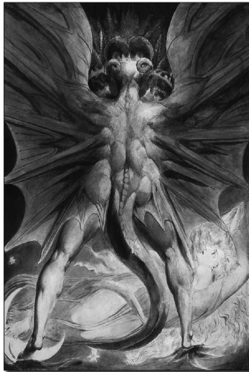
THE GREAT RED DRAGON & THE WOMAN CLOTHED IN SUN.. WILLIAM BLAKE

The Strigoi Vii Black Veil is Our Code and applies only to the Strigoi Vii or involved within the Sanguinarium. Employ these proven Principles and you will have a solid foundation for Zhep'r. Do not debate with others who disagree or cannot see the common sense outlined here. As they are not in agreement, simply smile and say, “We must agree to disagree, for free will is the whole of the law.”