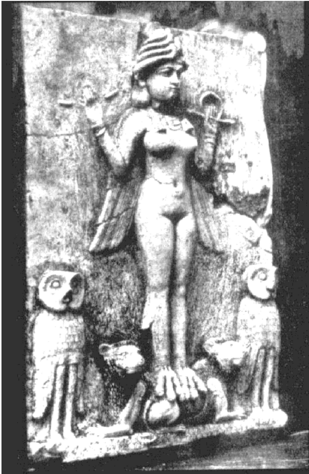
The Burney Relief, c2,000 - c1,950 BCE