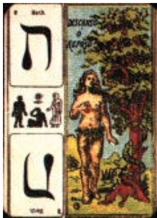
EVE CATALAN DECK

It seems that Etteilla was attempting to realign the images of the Major Arcana with a Greek creation story, a later, Alexandrian modification of the ancient Hebrew mythos of middle-eastern origin. Recent research shows that in changing the images of the Major Arcana, Etteilla was drawing from a Hermetic book, The Poimandres , a Greek treatise on the creation of the world and the fall of humanity into Eros. Essentially it's a Greek version of the Genesis story, but with differing names and an altered ordering of events. It fits the standard type of a hypostasis narrative.