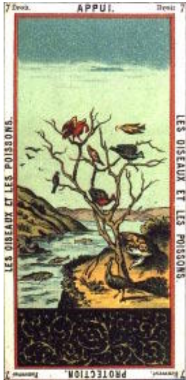
“THE BIRDS AND THE FISHES” AKA EMPRESS ETTEILLAS DECK

Elizabeth Cooper-Oakley's book The Count of St. Germaine names Etteilla as a compatriot to Masons and Martinists in his time. We also can