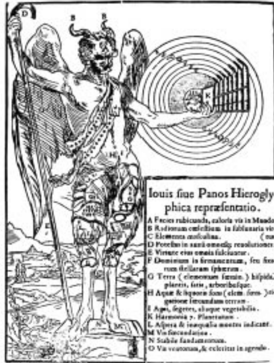
PAN/JUPITER KIRCHNER'S TAROT

As you gaze upon his illustration of Pan or Jupiter, it is difficult to miss how closely the "new" Devil image that appears in the 1660s resembles Kircher's conception. A shift in gender in evidence by Levi's time (late 1880's), in which the Devil gravitates from a masculine form, through a form with attributes of both genders, to the final female form, gives us the Baphomet image favored in the esoteric schools