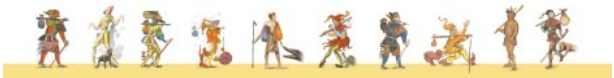
TABLE OF CORRESPONDENCES FOR THE CONTINENTAL DECKS