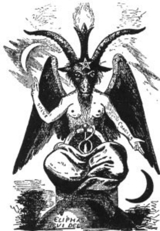
From Levi's Transcendental Magic . BAPHOMET. THE GOAT OF MENDES.