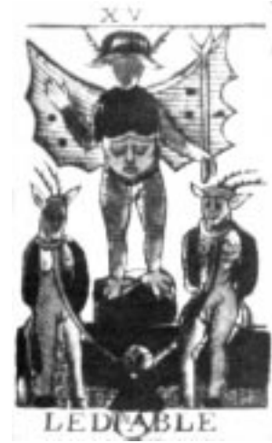
DEVIL JEAN NOBLET'S DECK

Two defining characteristics of the oldest Tarots were a Lovers card that shows "The Union of the King and Queen" theme, and a Devil card that shows the image of a traditional werewolf or lamia from European pagan antiquity. After the change in the late 1600s, those two cards are drawn to entirely different models, called the Two Paths and Typhon (or later Baphomet). These amendments to the Arcana can first be seen in the aforementioned two French Marseilles Tarots which appeared in the early 1660s. A century later these same amendments appeared as illustrations in Le Monde Primitif by Court de Gebelin, and Etteilla's Tarot also followed them faithfully. By the beginning of the 19th century, all schools of Tarot used the "new" models despite their other differences. Adjustments were made at the same time to several other Major Arcana, but the Lovers and the Devil serve as perfect "markers" in Tarots that accepted this new influence.