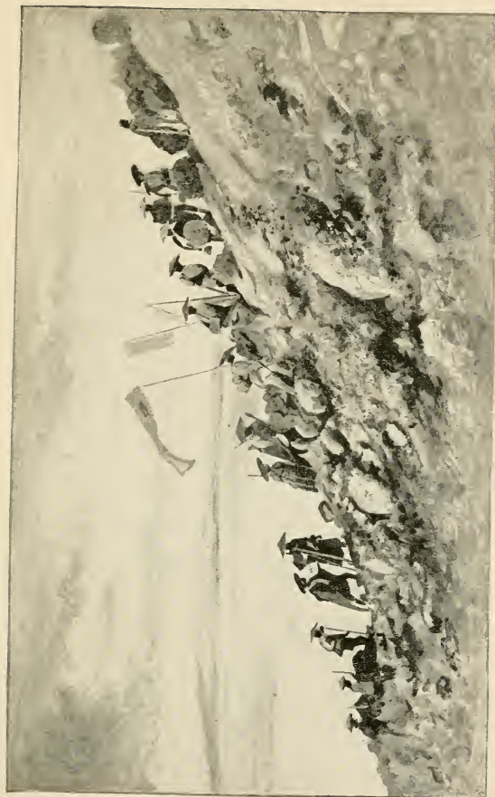
A PILGRIM CLUB ASCENDING ONTAKE