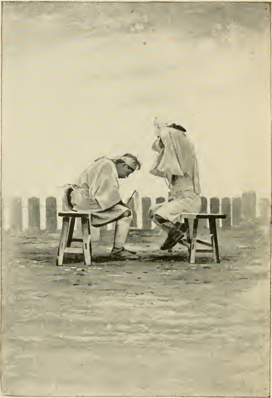
A POSSESSION BY THE GODS UPON ONTAKE. Page 6