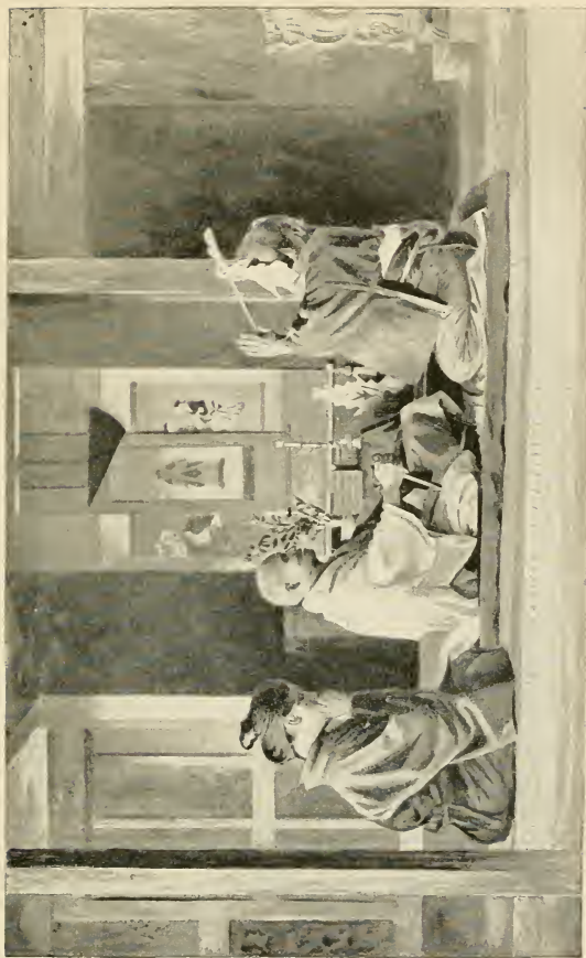
A BUDDHIST DIVINE POSSESSION