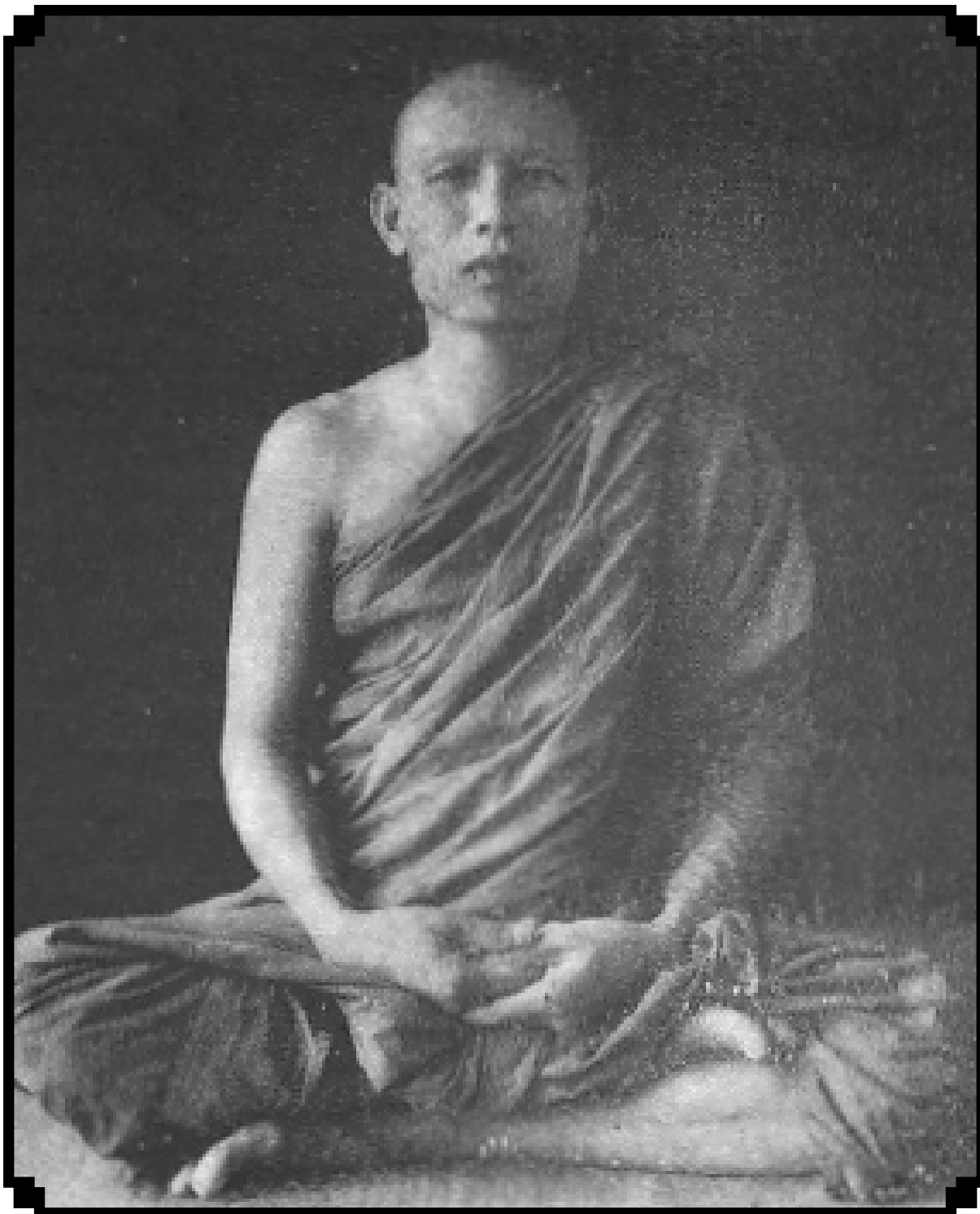
AJAAN LEE DHAMMADHARO