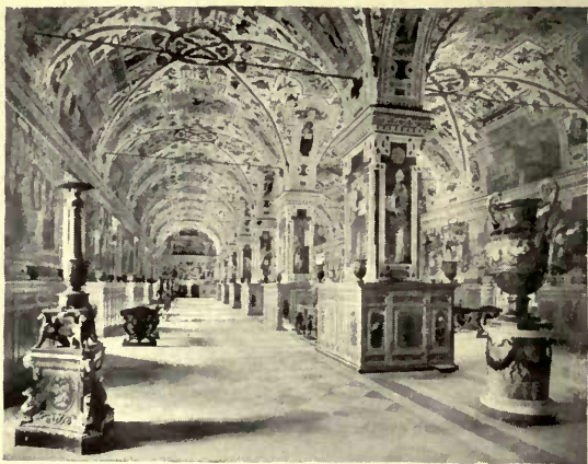
THE LIBRARY OF THE VATICAN, ROME.