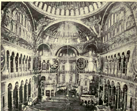
THE MOSQUE OF ST. SOPHIA, CONSTANTINOPLE.