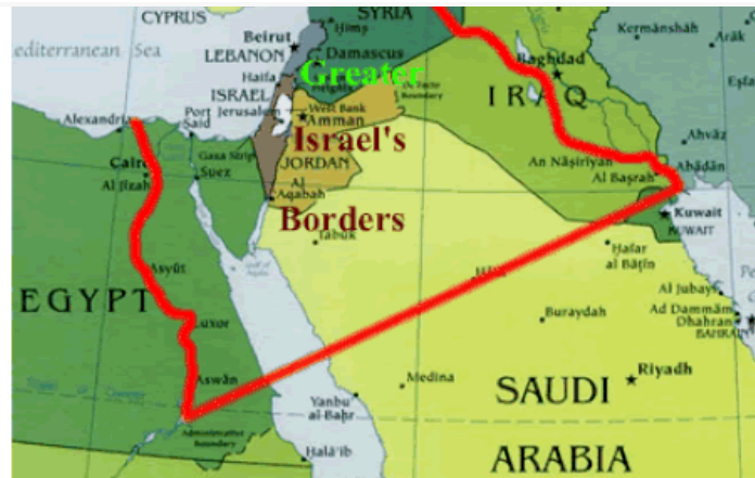
ERETZ ISRAEL (the Zionist plan for a greater "Israel")

It seems that Esau, masquerading under the name of Jew, is proving to be intolerable to the Jews themselves. The Book of Revelation long ago exposed this false element, describing them as "them of the synagogue of Satan, which say they are Jews, and are not, but do lie" (Revelation iii, 9).