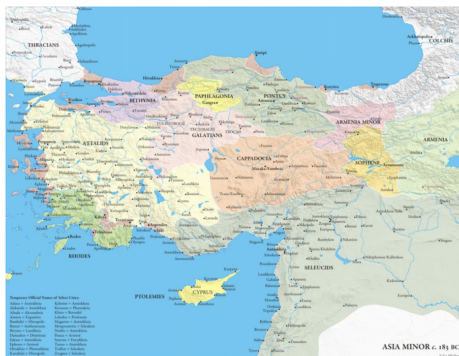
Map showing Anatolia (Turkey) and Armenia

Further, multitudes of the Jewish nation accepted Christianity in our Lord's day, and, as happened to the Apostles themselves, were rejected by the nation: their descendants became joined to the Christian church in different countries, and even to the British people, their kinsmen of Israel, who seized the Gospel with avidity , becoming Abraham's seed in faith also, and full heirs to the Promised Land.