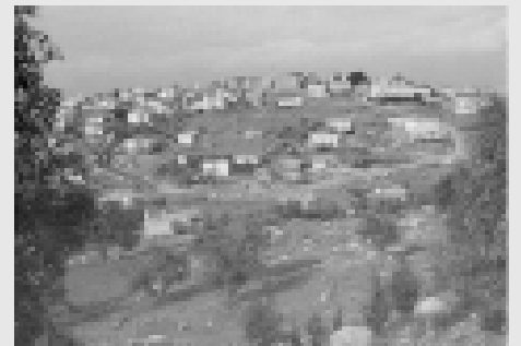
The village of Ibillin

At first I just stood when everyone else stood and sat when everyone else sat, not understanding what was being said or the symbolism behind any of the traditions involved; the swinging of the incense, the blessing with three fingers by the priest, the parading of the elements. It was all very strange and mystical to me. As I began to understand some Arabic and had a few lessons on the liturgy from my boss, I began to appreciate the ancient traditions as having their basis in the founding fathers of Christianity, traditions that go back almost 2000 years.