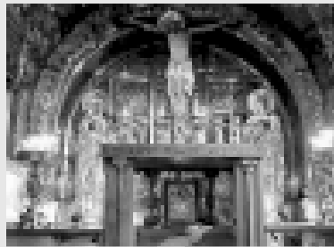
Golgotha, Site of the Crucifixion

The next day is called "Juma Hazini", Sad Friday, or "El Juma Al adtheema al Muqaddas", The Great Sacred Friday. None of the "Good Friday" euphemisms here. The death knell begins to ring at noon, the tra-