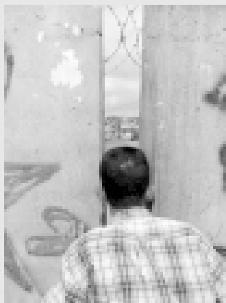
Looking through the Wall to Mount of Olives.

Within this same “holy land”, however, there are those who are forced to celebrate in a much different manner. In the occupied West Bank and Gaza Palestinian Christians are not always able to get to their churches to worship during Holy Week. Severe travel restrictions or roadblocks and checkpoints prevent them from getting to their churches in a land where religious freedom is supposed to be the right of all people. The construction of the security wall, in some places a concrete wall 30 feet high, in other areas a swath of land 150 feet wide with electronic motion detectors, razor wire fencing, and patrolled security roads, prevents Christians from going from their homes to their churches. In some places the wall is being built down the middle of a main road. If a