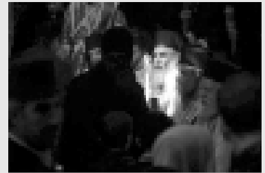
Priest carrying the Holy Fire

times by the eldest and most respected men of the congregation, while children follow behind throwing flower petals. (In a traditional burial service the casket is carried around the church instead.). Even though the men struggle under the weight of the burden, it is considered a great honor and blessing to be selected to carry the crucifix.