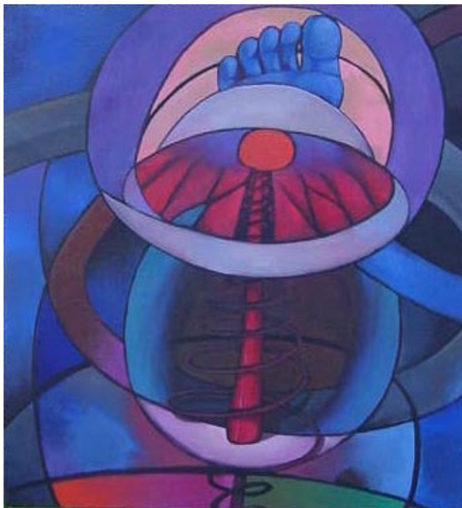
THE UNIVERSE BENEATH NUKVA 'S FOOT

BD §§ I, II, and III were included in the 1994-5 edition of The Kabbalah of Maat , along with a three-page “Commentary on the Book of Deviations ,” which had been compiled in 1993. Some additions from this commentary appear in the text {in brackets}.