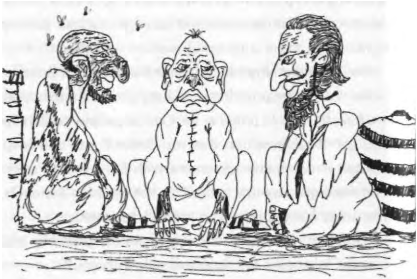
BAT HEW, BARK, AND ARROGANT BELIEVER

Arrogant Believer rang a small bell and a servant appeared; he whispered instructions to him and the servant left the room. "I will act on your promise and get the friends of Horus to come and talk to you. Horus was from a village north of here but has a Gopta name. His family likes the concepts of the Sun God but they went back to the Genius religion as their family grew for they realized that their ancestors were important. His family of course now lives in Old Town and we can, if necessary, introduce you to them. I am getting ahead of your needs," said Arrogant Believer.