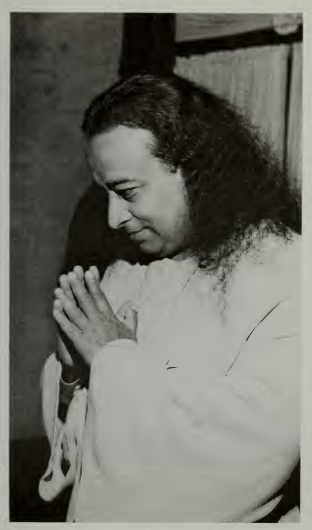
Paramahansa Yogananda at informal convocation of Self-Realization friends and members, Beverly Hills, California, 1949