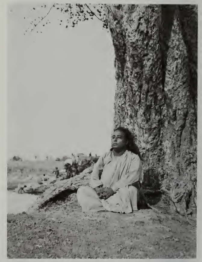
The Master meditating at Dihika, near first site of his school for boys, during visit to India, 1935. The school was relocated in Ranchi in 1918, where it continues to flourish.