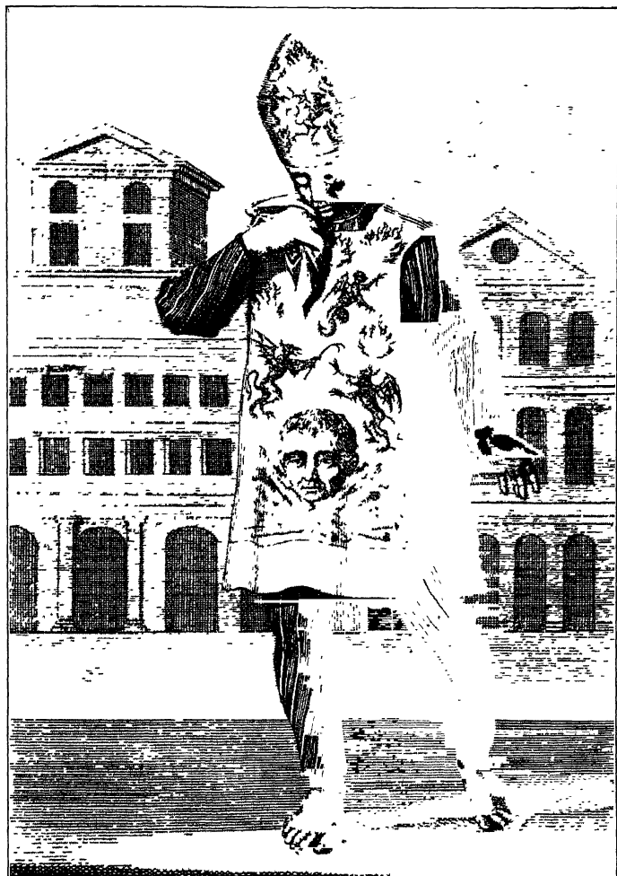
SANBENITO OF IMPENITENT