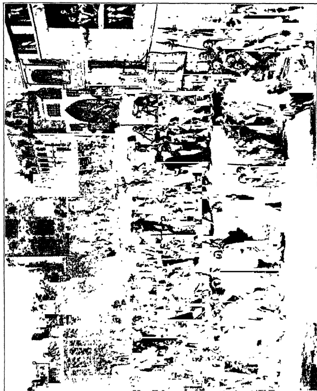
PROCESSION TO AUTO DE FÉ