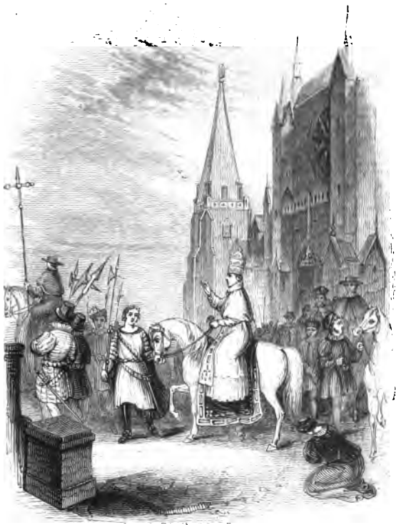
SUBMISSION OF PHILIP IV. TO THE POPE. Digitized by Google