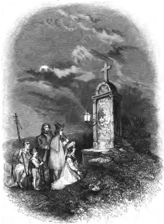
HOMAGE TO THE VIRGIN, by Google