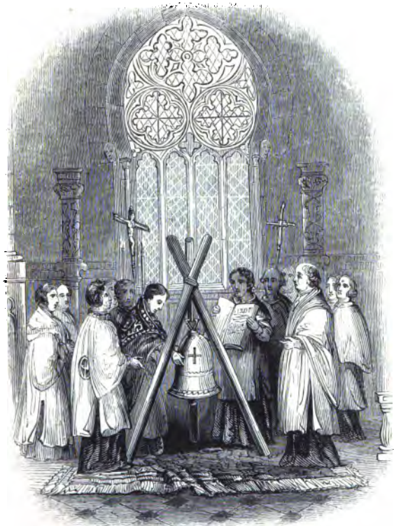
Digitized by Google CONSECRATION OF THE BELL.