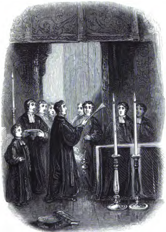
MASS FOR THE DEAD. Digitized by Google