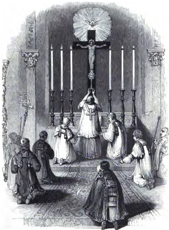
ADORATION OF THE WAFER. Digitized by Google