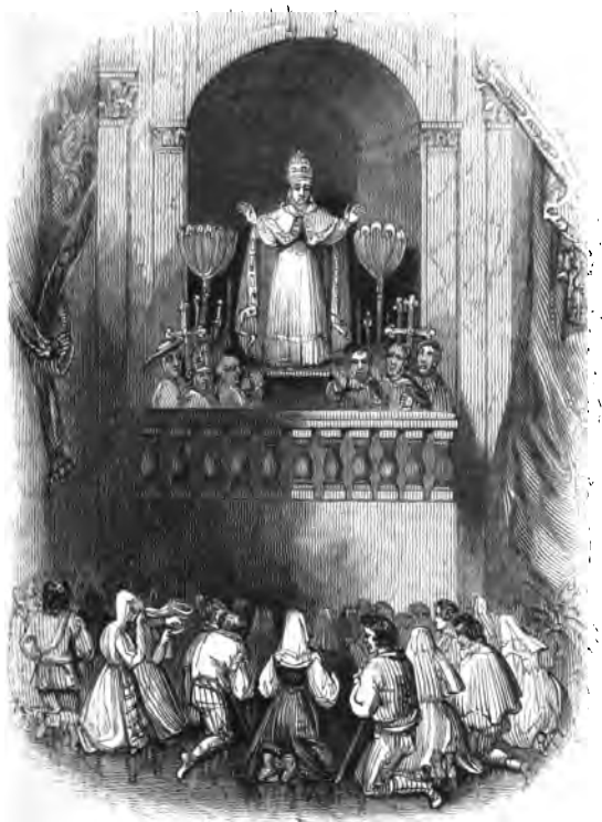
THE POPE BLESSING THE PEOPLE.