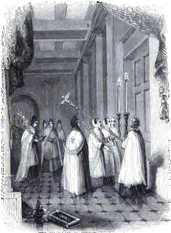
PROCESSION WITH PALMS.