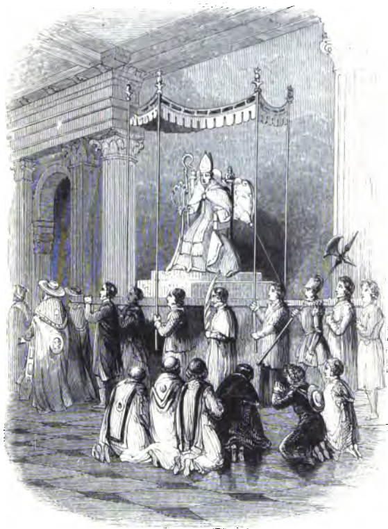
THE POPE, ON PALM SUNDAY.