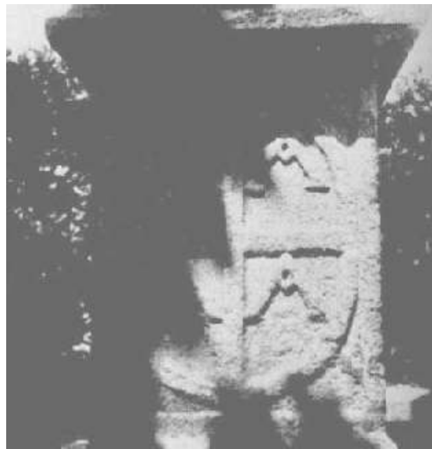
XLVIII. CYCLIC CROSS OF HENDAYE The four Sides of the Pedestal.