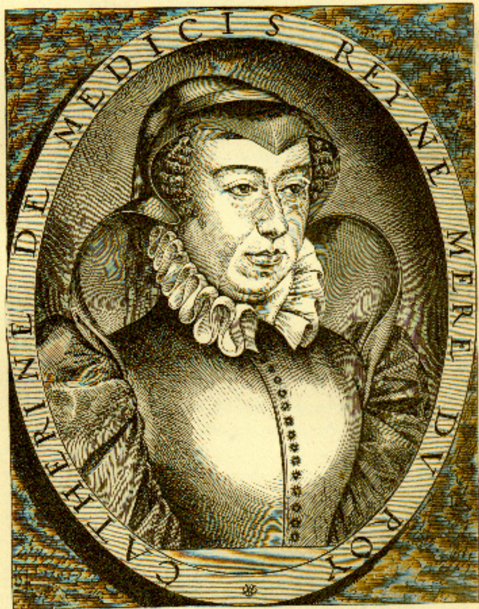
CATHERINE DE MEDICIS.