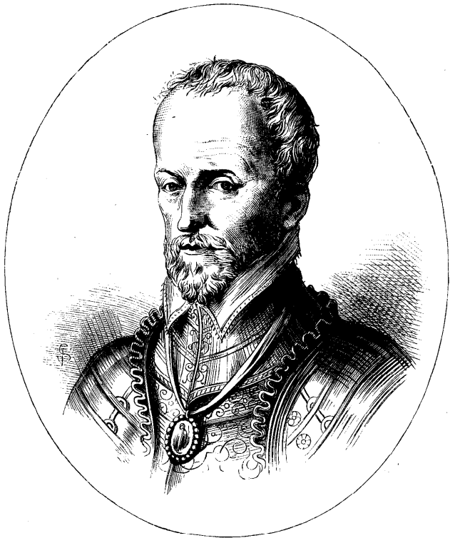
GASPARD DE COLIGNY, ADMIRAL OF FRANCE.