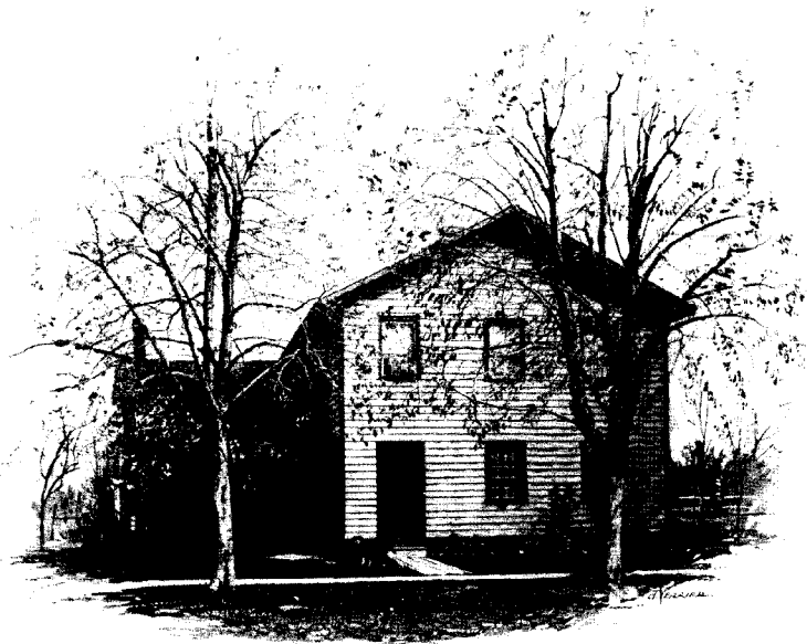
Birthplace of Ingersoll, Dresden, N. Y.

The two right-hand upper windows indicate the room in which he was born.