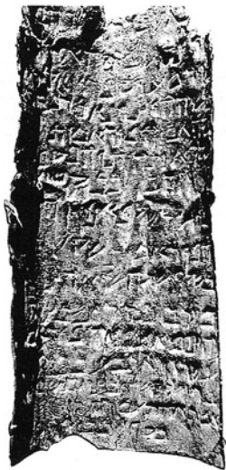
A cut segment from The Copper Scroll