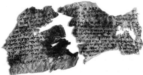
'Jubilees', Israel Antiquities Authority