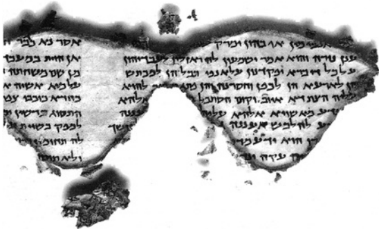
'The Targum of Job', Israel Antiquities Authority