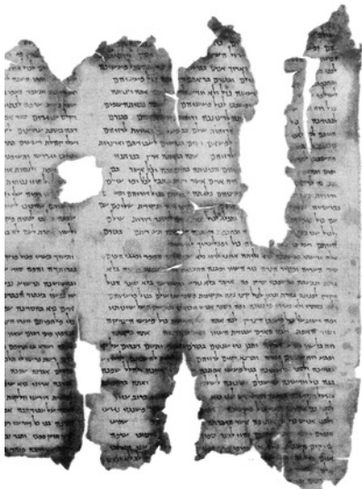
'Thanksgiving Scroll', The Shrine of the Book, Israel Museum, Jerusalem