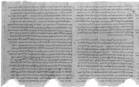
'The Manual of Discipline', Israel Museum, Jerusalem