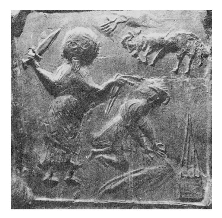
Figure 6. Terracotta tile, North Africa, sixth century CE; Musee du Bardo, Tunisia. After Gutmann, "Variations," in idem, Sacred Images , XIII, pl. 8, fig. 4.

much like the pagan-style altar of earlier representations. Other persisting features include: the fire alight on the altar, the hand of God, the tree with the tied ram. Two oddities—Isaac's seemingly suspended position and what looks like strange sort of "scarf" at his neck, seem to make this representation "of no known category."<sup>77</sup>