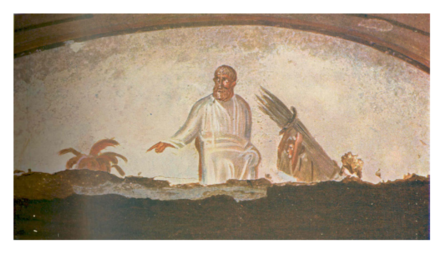
Figure 2. Arcosolium fresco from the catacomb of Priscilla (late third or early fourth century). After J. Wilpert, Die Malereien der Katakomben Roms (Freiburg im Breisgau: Herder, 1903), fig. 78.

back, which reinforces the suggestion that this is a pre-sacrifice scenario.<sup>67</sup> The parallel panel features the three young men standing in the midst of the flames with uplifted hands, while a dove with olive branch (from Noah iconography), here representing the holy spirit, flies in overhead. The juxtaposition of the two images (with an element of Noah thrown in), reinforces the notion that we are being brought into the story before the moment of deliverance has arrived.