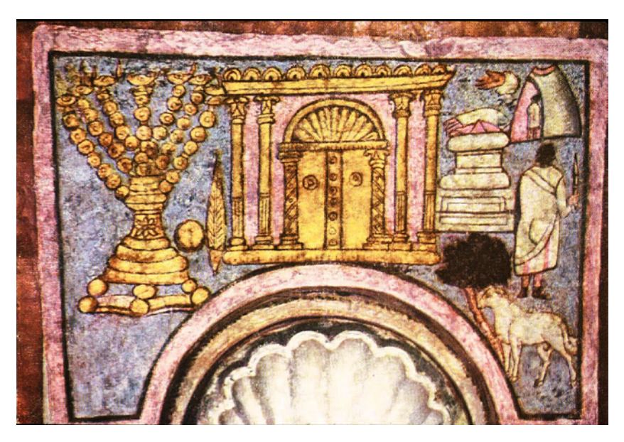
Figure 1. Dura Europos Synagogue (mid-third century), fresco above the Torah ark.

prominent in the foreground is the ram, tied to a tree. This last detail, although it would appear to contradict the biblical narrative (at least in Hebrew), emerges literarily through a reading of the various translation traditions, which gloss the sabek as "tree" ( phuton in Greek; ilana in the Aramaic targums). This detail has been read by many commentators to indicate that the emphasis in this "midrash" is entirely on Isaac's redemption; the fact that the ram is tied suggests that this redemption has been God's intention all along.<sup>61</sup> The background figure in the tent (whether Sarah or someone else) may be functioning to remind us of the original promise to Abraham (after he opens his tent to the three visitors), that it would be "through Isaac" that God would fulfill the covenant (Gen 18:10; cf. 17:21); in a sense, the image gives us a progression of three narrative moments—promise, crisis, and redemption. Thus, the Dura painting portrays Isaac as the channel of God's blessing, covenant, and promise of future redemption, linked to Torah and Temple.