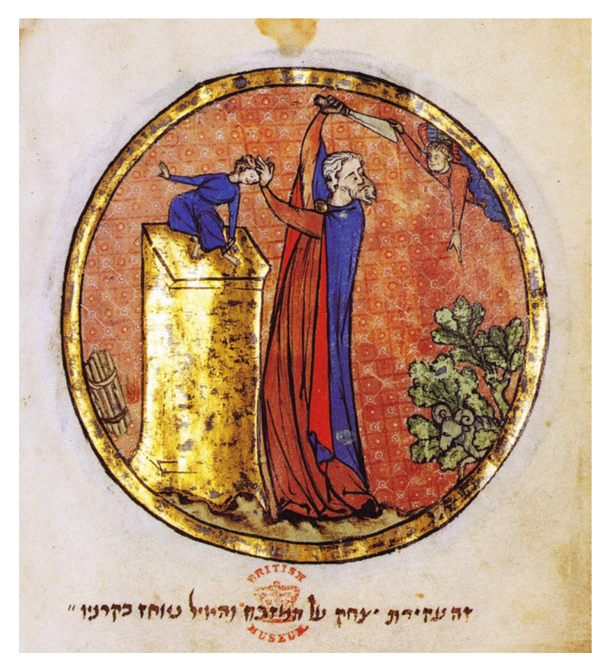
Figure 8. North French Hebrew Miscellany, f. 521v.

the uplifted sword in the hand of Abraham. Like other miniatures in the Miscellany , this one bears compositional and iconographic resemblances to biblical scenes produced in French Christian artisan workshops, particularly those of the St. Louis Psalter (produced before 1270).<sup>89</sup>