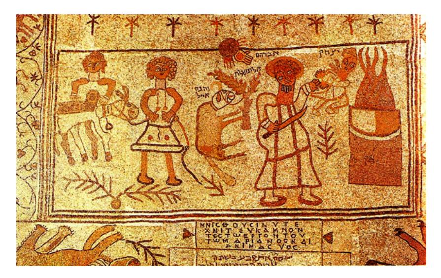
Figure 5. Beth Alpha synagogue mosaic (sixth century CE).

Thus, the question becomes not only, whence this form of the iconography in the first place, but why the nonliterary image persists, even when it companions the biblical text? A possible answer to both questions may be found in Joseph Gutmann's discussion of the Akedah mosaic in the Bet Alpha synagogue (sixth century; Fig. 5).<sup>75</sup> Here, as in Dura, we have a narrative sequence, including this time the young men who come with Abraham,<sup>76</sup> moving to the moment of sacrifice on an altar that looks very