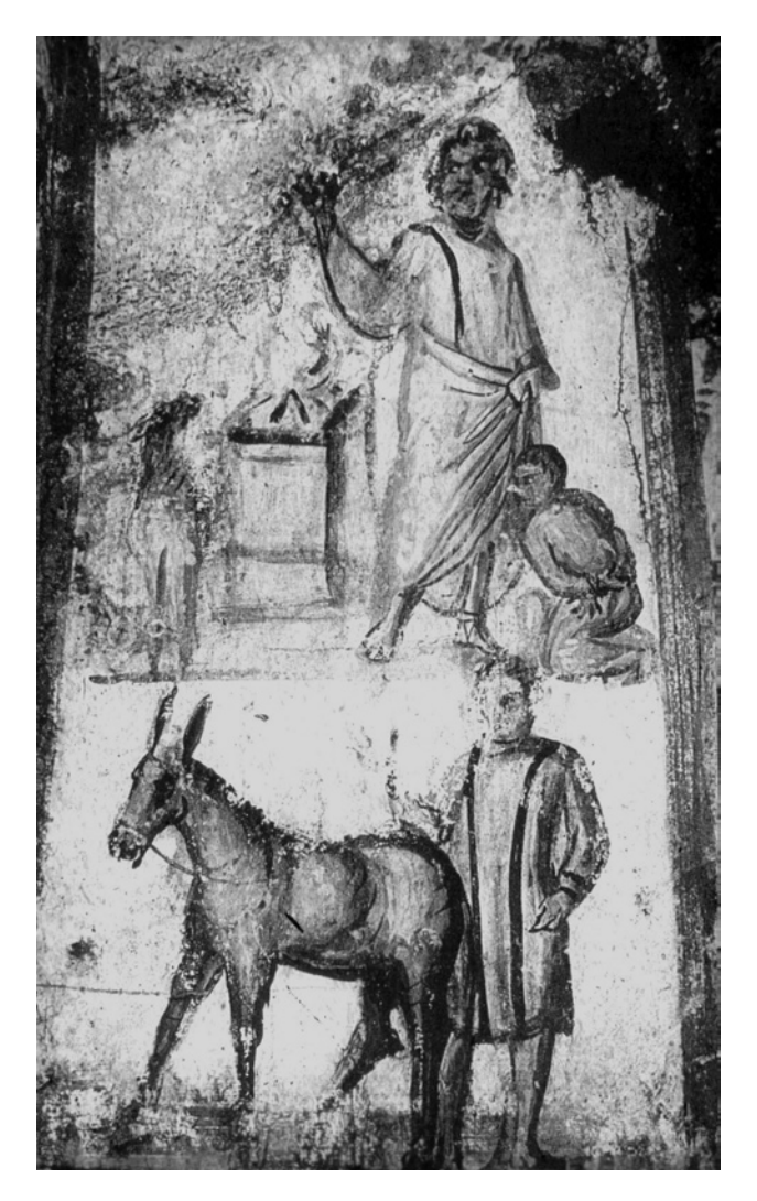
Figure 3. Cubiculum C, Via Latina (Late fourth century).