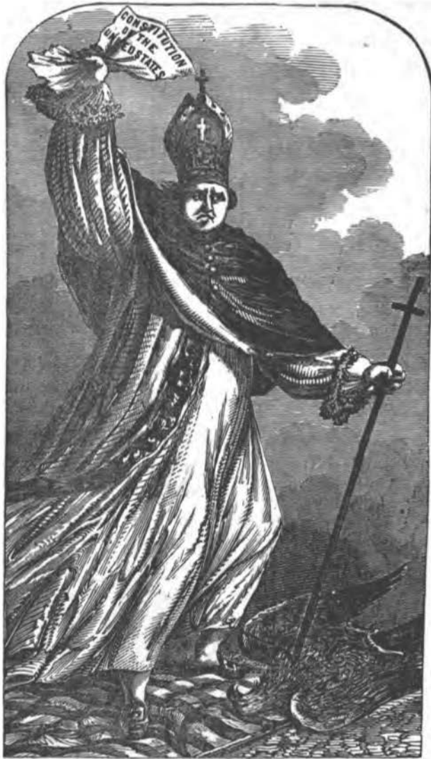
THE AIM OF POPE PIUS IX.