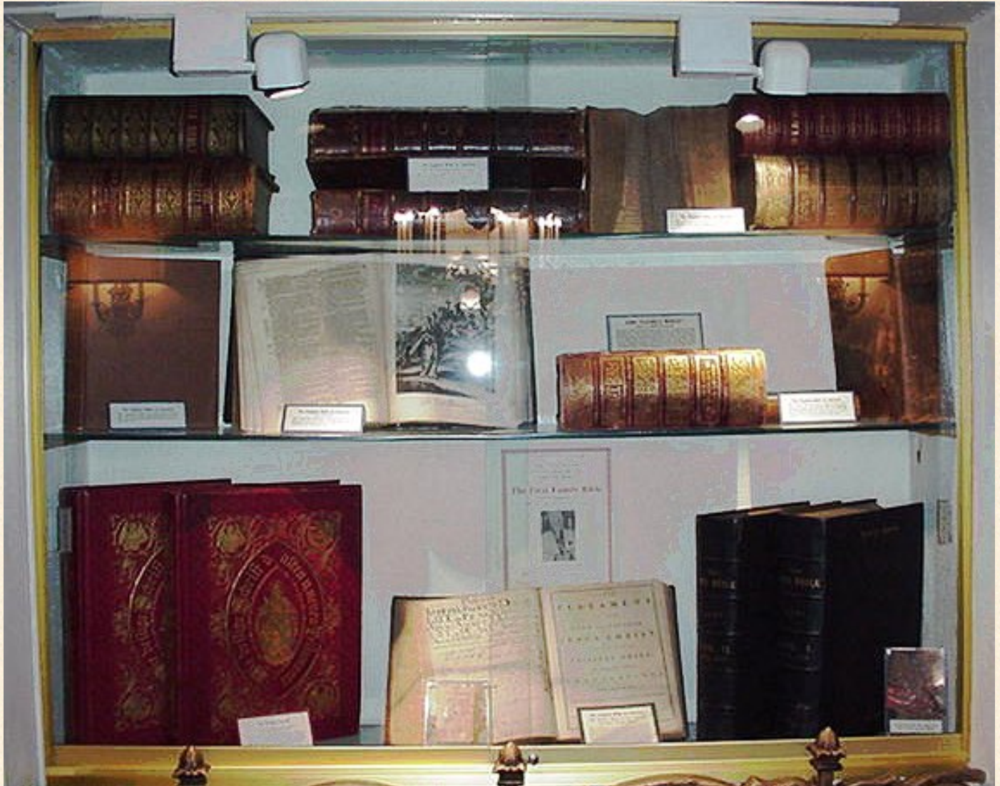
View of Station 29

This Station includes the following Bibles, among others: