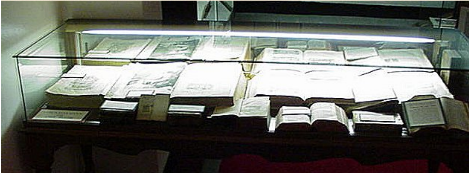
Station 8 - showing a variety of works

This Station shows a number of 16th & 17th Century Bibles, including, among others: