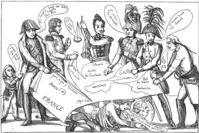
Karikatur auf den Wiener Kongress.