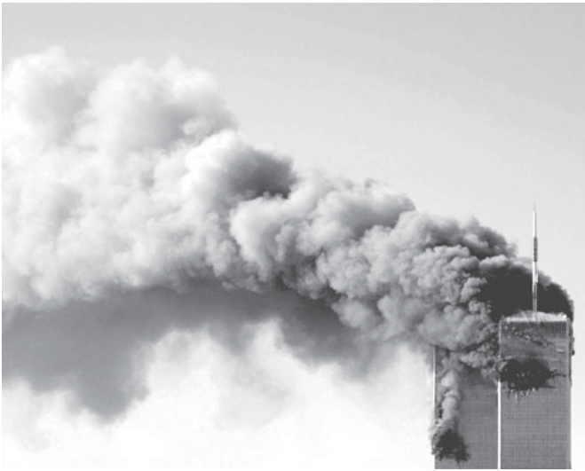
11. The twin towers of New York's World Trade Center on fire after being struck by airliners seized by Al Qaeda suicide hijackers on 11 September 2001.