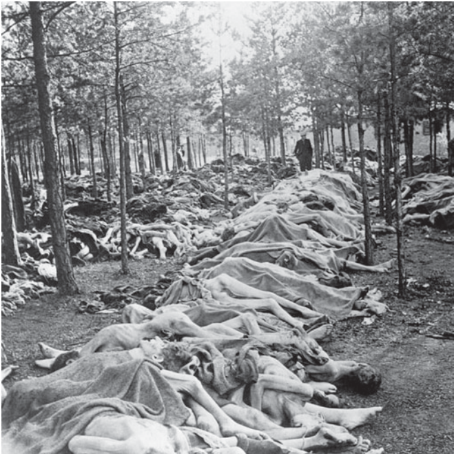
16. Victims of the Holocaust, the mass murder of Jews in continental Europe by the Nazis between 1940 and 1945. Six million died, the worst ever act of genocide.

The term genocide originated in the 20th century. Although the phenomenon occurred in previous centuries, the last century could truly be called the Age of Genocide and ‘ethnic cleansing’,