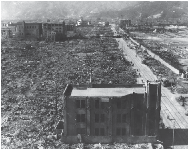
14. Hiroshima after the Allies dropped an atomic bomb on the city (6 August 1945). Three days later an atomic bomb was dropped on Nagasaki. Both cities were almost entirely destroyed and over 200,000 inhabitants were killed.

that nuclear weapons are described (that is, in the ‘kiloton’ or megaton range) is a measurement of the amount of TNT which would be required by a conventional weapon to approximate to the explosive force of a nuclear weapon, but this does not remotely capture the truly horrific nature of the effects of nuclear weapons. The evidence we have on the impact of nuclear bombs dropped on cities comes from the atom bomb attacks on the Japanese cities of Hiroshima and Nagasaki on 6 and 9 August 1945 respectively. It is important to note that these atomic bombs were very small compared to modern nuclear weapons in the megaton range. Bruce Roth in his powerful work No Time to Kill draws attention to the vivid observation by Carl Sagan: ‘Modern thermonuclear warheads use something like the Hiroshima bomb as a trigger – the “match” to light the fusion action.’