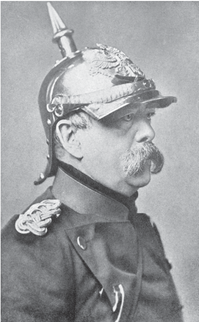
5. Prince Otto von Bismarck (1815–98) was Prime Minister of Prussia (1862–90). He used Prussia's military strength and his political cunning to defeat Austria and France and become the first Chancellor of the German Reich in 1871.