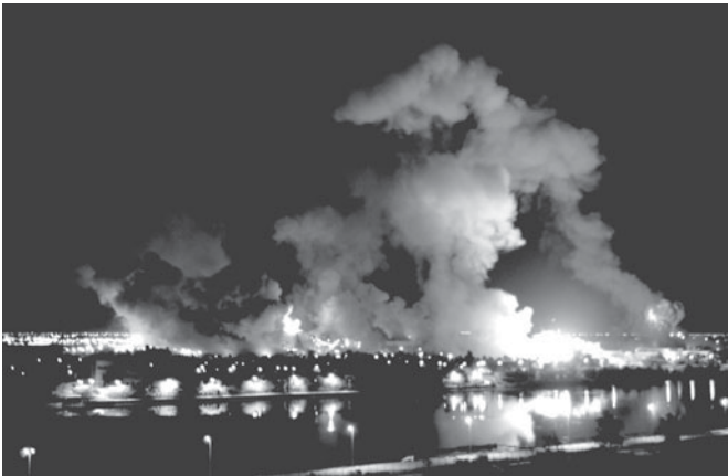
15. The bombing of Baghdad in March 2003 during Operation Shock and Awe.

foolishly cast aside by the US and UK governments in the lead up to the Iraq War in 2002–3. It is worth bearing in mind that if Dr Hans Blix had been given time to complete the rigorous weapons inspection he was leading in Iraq, the prolonged war in Iraq which has cost so many thousands of lives could have been avoided.