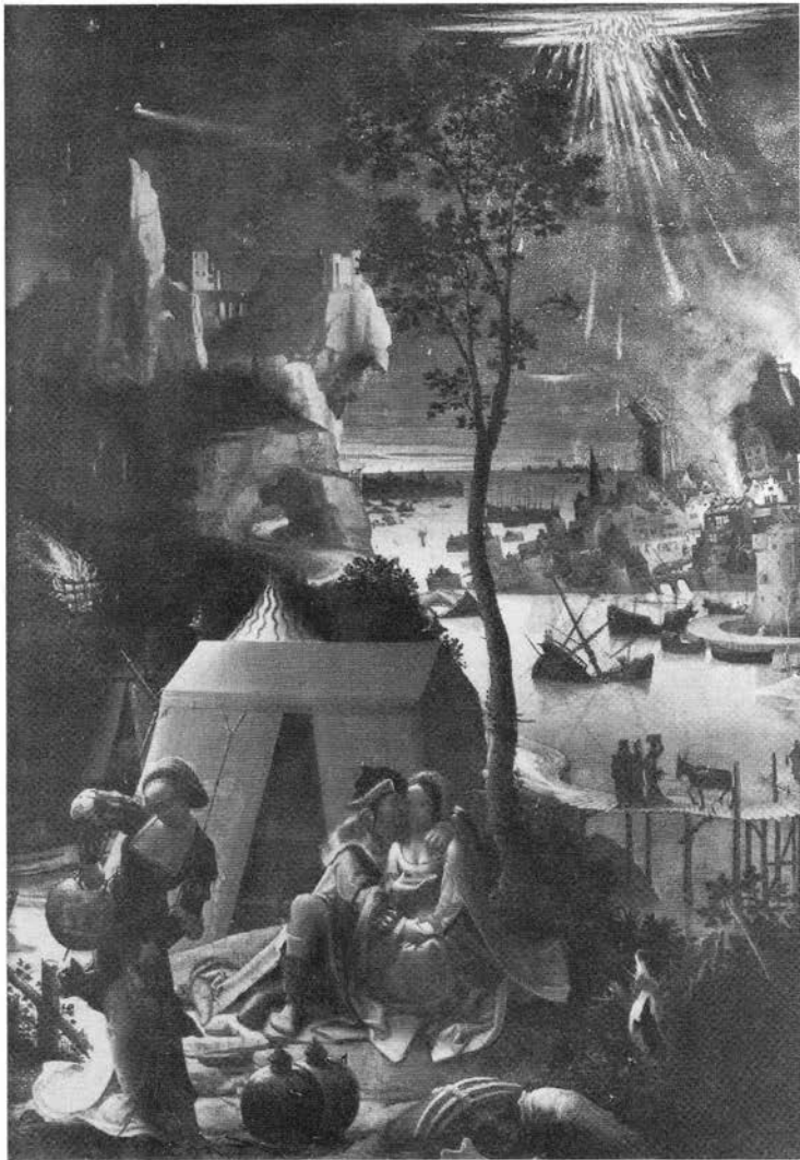
Lucas van Leyden, Lot and His Daughters, 1609. Musée du Louvre, Paris.