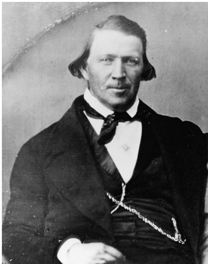
8. Brigham Young, 1851.

congregation was asked to vote, they raised their hands for the Apostles. A month later Rigdon was still asserting his superiority to the Twelve and was excommunicated. The following spring he organized his own church with its own apostles and prophet. Ignoring his other rivals, Young took charge of the main body of the church as it prepared for its western exodus.