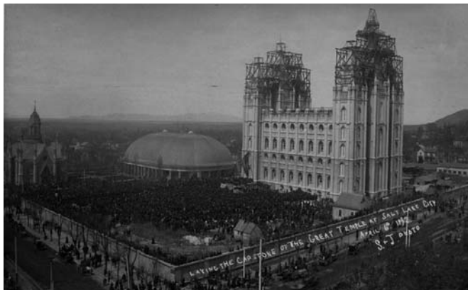
10. Large crowds celebrate the laying of the capstone of the Salt Lake Temple in 1892. The temple took forty years to build.