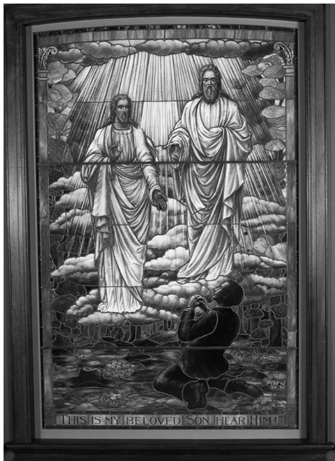
2. A stained glass window depiction of Joseph Smith's First Vision, installed in the Adams Ward, Los Angeles, in the early twentieth century.

Rather than doubting his vision, however, Smith lost confidence in the clergy and the churches and chose to live by his own lights. He put his own revelations above the judgment of the learned ministry. In this decision, Mormons see the precedent for the principle governing