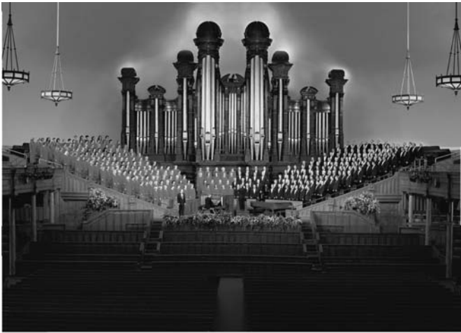
11. The 360-voice Mormon Tabernacle Choir has been broadcasting Music and the Spoken Word since 1929.