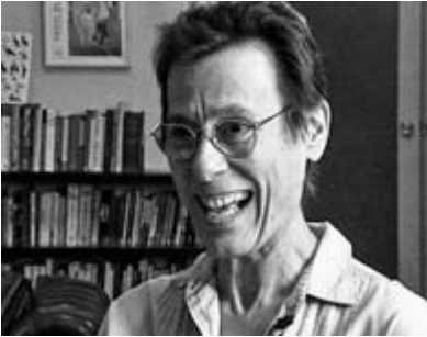
1.2. Yvonne Rainer