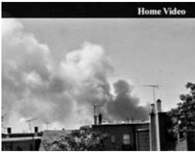
23. The Land of Artistic Expression (Slate Bradley, 2001)

Bradley's video The Land of Artistic Expression takes this pursuit of and respect for the opacity of emotional performance in the context of collectively processed trauma to a more extreme place than even the previous case. Bradley shot this video on 9/11/2001. 47 Having seen the news on television, he went up to his roof and turned on his camera. A matte on the top of the screen says HOME VIDEO as though this footage were taken from the television itself—because, as the security camera example highlighted, one can no longer see any footage outside of its potentiality as evidence .