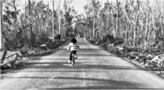
25.1–25.2. South of Ten (Liza Johnson, 2006)

passee. The kids are neither manifestly virtuous nor wise. Mainly they are playing: riding bikes, circulating. They play and collect what's on the ground because that is their usual mode of passing time. But this age-appropriateness produces a tacit contrast between the traditionally sentimental subjects and their elders. Scavenging is a game for kids; for the adults it is life itself now, amidst crisis. Crisis turns out not to be fast, but stretched and slow: the adults work, take breaks, sit down, stare out. This is what life south of Interstate 10 has been reduced to.