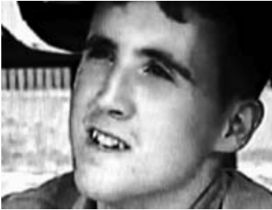
19.1 and 19.2. Civilian and soldier break through the silence

ward. Forced to cruise, to coast, and to be open to receiving impacts whose generic expectations cannot be prepared for in advance, the audience is nonetheless not being prepared to be open to everything. The eye is made to separate from the present as a space of continuity or narrative cohesion and to feel not assured about much. But its mission remains to witness the flaws in the national symbolic as it saturates the everyday; to feel the impact of imperial violence; and, tacitly, to convert the outrage to the senses into collective critique.