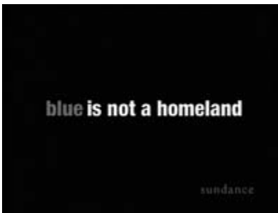
17.1–17.3. The PSA Project #1: Color Theory (Madansky, 2005)