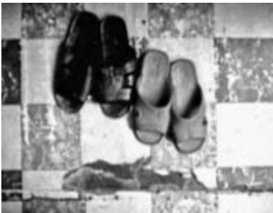
18.1–18.5. Madansky, PSA: Icons of the U.S. ordinary