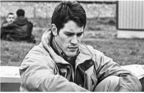
12. Franck, imploded

that de-ontologizes the face and embeds its stunned expressivity in a historical zone of circulation, affect management, and self-projection.