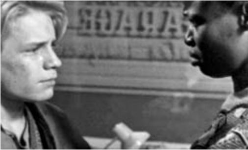
5.1–5.2. The hug and the impasse (Dardennes, La Promesse , 1996)

Riquet, Igor does not exactly know what he is doing when he enters a plot, if not a life, with Assita. He works out of a headstrong, aggressive incoherence: he abandons an affect that he doesn't want to have, to risk having one he can barely imagine.