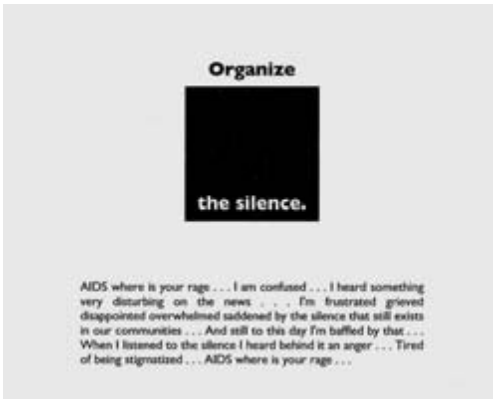
21.1–21.2. Ultra Red records “the silence”