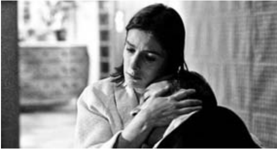
15.1–15.2. Affective truths, empirical lies

easy to talk to. Good atmosphere. But still perverse. That makes lying easy. Tell myself everything's fine. That's a lie. I'm afraid I'll disappoint.