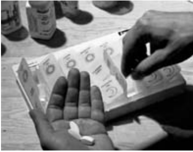
2.1–2.2. Claire Pentecost and Gregg Bordowitz, Rituals of the Day ( Habit , 2001)

forces transecting a scene without adding up to some big summation. Biography, psychology, law, mode of production, intentionality: all of these are in play, but no single logic provides assurance about the conditions of the endurance of the present.