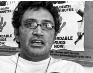
1.3. Zackie Achmat