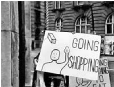
20.1–20.7. We Are Watching You (Surveillance Camera Players, 2001)