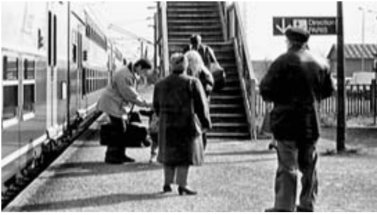
9. Franck brings the New Normal (Cantet, Human Resources , 1999)