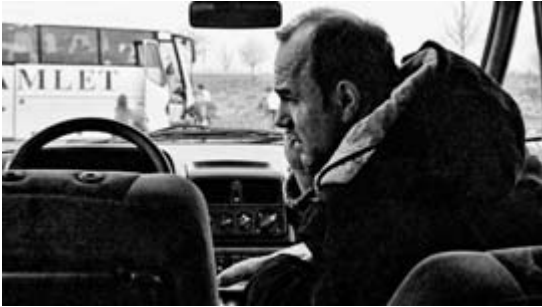
13.1–13.2. Vincent opens at an impasse (Cantet, Time Out , 2000)

up, and one imagines that imminent to this moment is a disaster—an instance of sexual perversion, a child kidnapping, a bad divorce, a suicide—an event, in other words, where a gesture could well become an act that destroys the ordinary thoughtlessness of the present and sends us into grey economies, underworlds or otherworlds that no one wants to live in, at least for long.