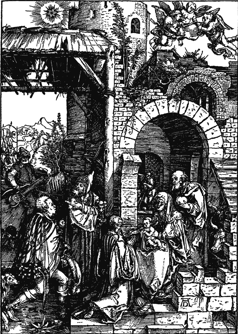
2. 'The Adoration of the Magi', by Albrecht Dürer, from The Life of the Virgin , 1511 ( Albrecht Dürer: The Complete Woodcuts , Artline Editions, Bristol, 1990, p. 61).